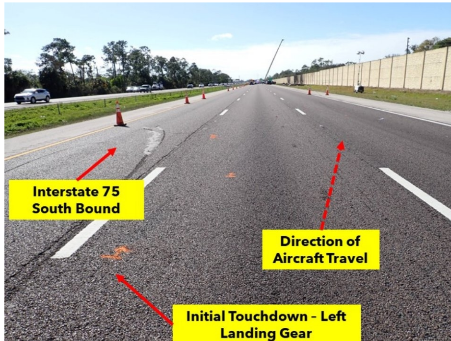
Figure 2 Annotated photograph of the airplane's initial touchdown point on Interstate 75.

The forward portion of the fuselage was consumed by the post-impact fire (see figure 3). All major components of the airplane were accounted for at the scene, and the ground surrounding the wreckage was fuel-soaked having an odor consistent with Jet-A fuel. The cockpit center console was found separated from the main wreckage. Both engine throttle levers were found near the IDLE stop position. The flap selector handle was found in a position consistent with 45° flap extension.